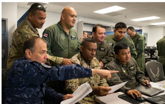
Service members from partner nation air forces work together during PANAMAX Aug. 14, 2017. The week-long exercise focused on security of the Panama Canal.

economic initiative—and the continued provision of financing and loans that appear to have ‘no strings attached’ provide ample opportunity for China to expand its influence over key regional