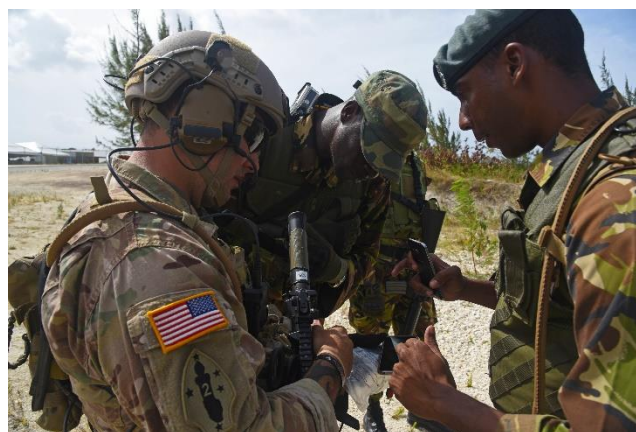
U.S. Army National Guardsman with Barbados Defence Force members during a USSOUTHCOM-sponsored Tradewinds Exercise June 8, 2017.

We regularly promote jointness in annual multinational exercises. Last year we supported the Dominican Republic's creation of a professional NCO Corps, South America's first-ever Senior Enlisted Conference, and continued regional leadership on effective gender integration in military and security forces and peacekeeping