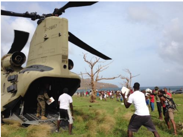
The DOD distributes USAID relief supplies in Dominica Sept. 27, 2017.

multinational organizations. The return on this investment was evident in 2017, with CDEMA, CARICOM, and the RSS playing critical roles in the regional response effort to Hurricanes Irma and Maria, and multiple nations providing assistance to their Caribbean neighbors. For our part, by leveraging flexible, dual-purpose SPMAGTF forces already in the region, we were able to