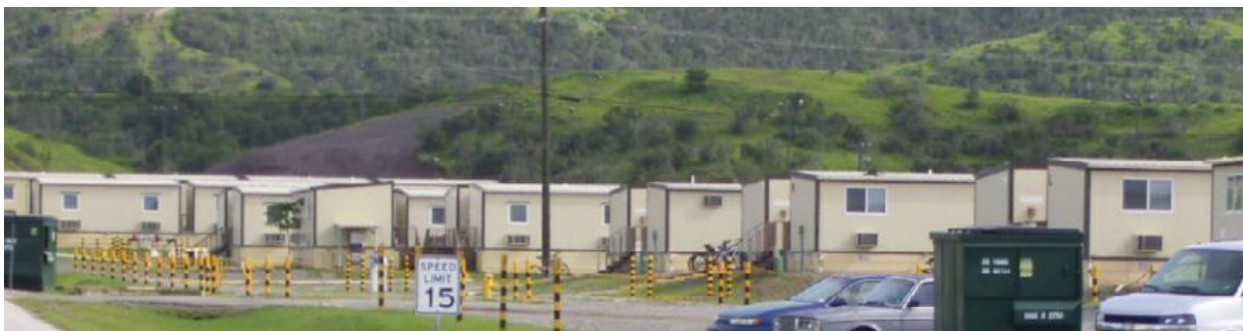
An estimated 580 troops live in containerized housing units manufactured in 2006 and 2008. All units have exceeded their economic life of five to seven years. Common problems with the units are roof leaks, plumbing failures and mold growth.

Our no-fail mission: detention operations. Although most of our efforts are focused on engaging with our partners in Latin America, we also continue the safe, humane, legal, and transparent care and custody of the remaining detainees at JTF-GTMO. As many members of Congress have witnessed firsthand, the medical and guard force at JTF-GTMO are not merely caring for these detainees; they are providing the best of care . Our troops in close contact with detainees face periodic assaults and threats to them and their families, yet they remain steadfast in their principled care and custody role. Every day they demonstrate the same discipline, professionalism, and integrity as they confront the same dangerous adversaries as our men and women fighting in Afghanistan, Iraq, and elsewhere around the world. I know this Committee, our Secretary of Defense, and our President applaud their commitment and share my pride in