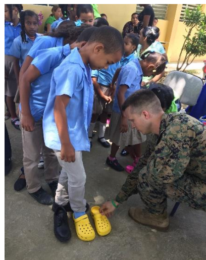
USSOUTHCOM coordinated the donation of 600 pairs of shoes from the Shuzz Fund during the 2016 NEW HORIZONS exercise.

treated nearly 30,000 patients, conducted 242 surgeries, and constructed schools and clinics in remote areas. Similarly, our training missions like JTF-Bravo's medical engagements and CONTINUING PROMISE bring together U.S. military personnel, partner nation forces and civilian volunteers to treat tens of thousands of the region's citizens. We are also building basic infrastructure like schools, medical clinics, and emergency operations centers and warehouses for relief supplies. These activities provide training opportunities for our own personnel, while also improving the ability of our partners to provide essential services to their citizens and meet