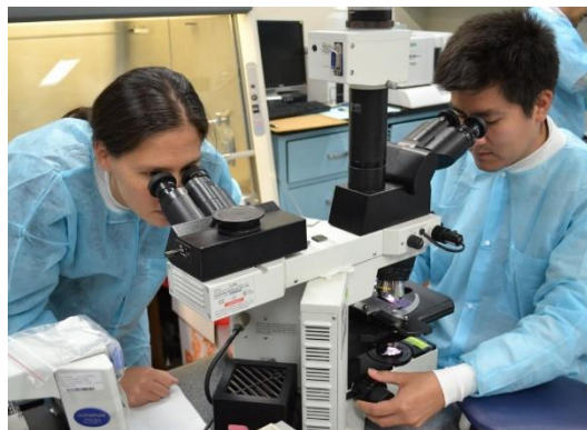
The U.S. Naval Medical Research Unit 6, located in Lima, Peru, prevents, detects and responds to disease outbreaks, in particular, mosquito-borne illness to include Zika, dengue fever and chikungunya.

Regionally, our health and medical readiness engagements build partner nation capacity—including infrastructure, equipment, and skilled personnel—to prevent, detect, and respond to disease outbreaks. At the early stages of the Zika outbreak, the U.S. Naval Medical Research Unit 6 (NAMRU-6), based in Peru, established research sites in partnership with Colombia, Guatemala, Honduras,