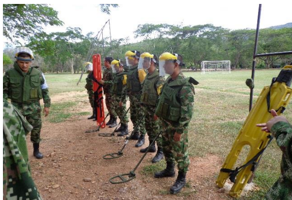
A Colombian demining team conducting demining drills.

In Colombia, the 52-year conflict has also left the country among the world's most