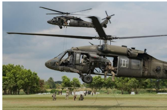
A pair of UH-60 Blackhawk helicopters assigned to Joint Task Force-Bravo’s 1st Battalion 228th Aviation Regiment provide aviation support during Operation Serpiente, a joint air assault training mission led by members of the U.S. 7th Special Forces Group and Naval Special Warfare, Dec. 2, 2016 at Ilopango Airport, El Salvador.

We’ve also helped enhance their land interdiction capabilities through training, essential infrastructure, and mobility and communication equipment. As a result, we’ve seen significant improvements across Central American security and military forces. Guatemala’s Interagency Task Forces (IATFs) combine the best of military and law enforcement authorities and capabilities, helping control Guatemala’s borders and stopping the illegal flow of people, drugs, and other threat network activity. Honduras has also made a concerted effort to dismantle threat networks, extradite suspected drug traffickers to the U.S., and eliminate corruption. Panama is coming off a record year disrupting threat network operations. As we seek to intensify combined operations, Panamanian efforts to counter a wide spectrum of threats showcase them as an