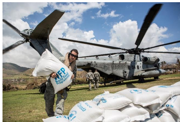
U.S. service members from Joint Task Force Matthew offload bags of food from the World Food Programme onto a pallet in preparation for delivery to the areas affected by Hurricane Matthew in Port-au-Prince, Haiti, Oct. 12, 2016. By the end of their mission, Joint Task Force Matthew delivered 275 metric tons of supplies and conducted 98 missions in support of USAID/OFDA and the Government of Haiti.

Additionally, the immediate deployment of elements from U.S. Transportation Command's (USTRANSCOM) Joint Enabling Capabilities Command (JECC) was absolutely critical to our effective response. U.S.-based forces deployed aboard the USS MESA VERDE and USS IWO JIMA also provided robust relief from the sea. During the relief mission, we also coordinated with our U.S. Coast Guard (USCG) partners to deter potential migration in the aftermath of the hurricane and supported the